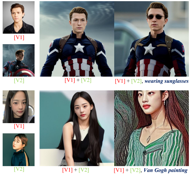
Figure 6: Users can further manipulate the composed results using prompts with additional description.

Applications Since our method is robust to generalizations, users can further manipulate the composed results us-