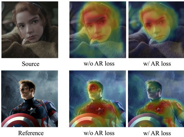
Figure 3: Visualization of aggregated attention maps from UNet layers before and after the application of Attention Refocusing (AR) loss illustrates its importance in achieving information disentanglement and preventing information spill.

concepts during the optimization phase and employ a composed prompt during inference to generate multi-concept images. A comprehensive overview of our approach is depicted in Fig. 2, and the details of our method will be elaborated upon in the subsequent sections.