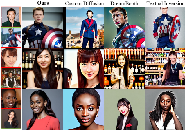
Figure 5: Qualitative comparisons of MagiCapture with other baseline methods.