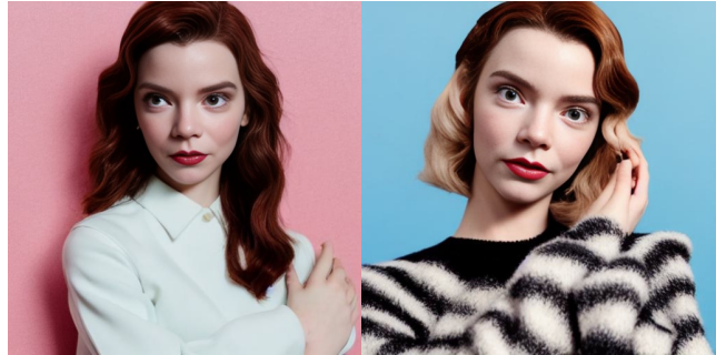
Figure 7: Failure cases: Proposed method occasionally produces abnormal body parts such as limbs, fingers

ing prompts with more descriptions (e.g., c'_c = \text{“A photo of [V1] person in the [V2] style, wearing sunglasses.”} ). We demonstrate such results in Fig. 6 and in the supplement.