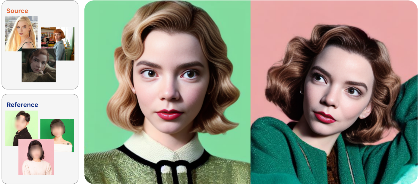
Figure 1: Generated results of the proposed MagiCapture , a multi-concept personalization method for integrating subject and style concepts to generate high-resolution portrait images using just a few subject and style references.

1 KAIST AI, 2 Sogang University {sharpeeee, jchoo}@kaist.ac.kr, tllswody123@sogang.ac.kr